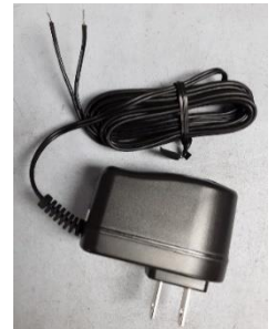
Figure 1 POW-00005 Power Supply

Step 4: Once the BinTrac System and the HouseLink HL-10S is installed and powered up, press the RESET button on the board. This will force the device to power cycle allowing it to discover any devices.